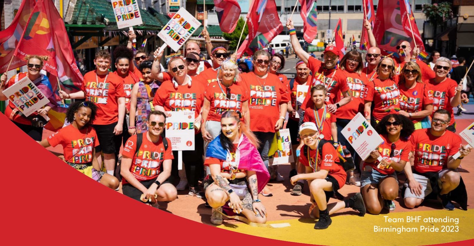
Team BHF attending Birmingham Pride 2023