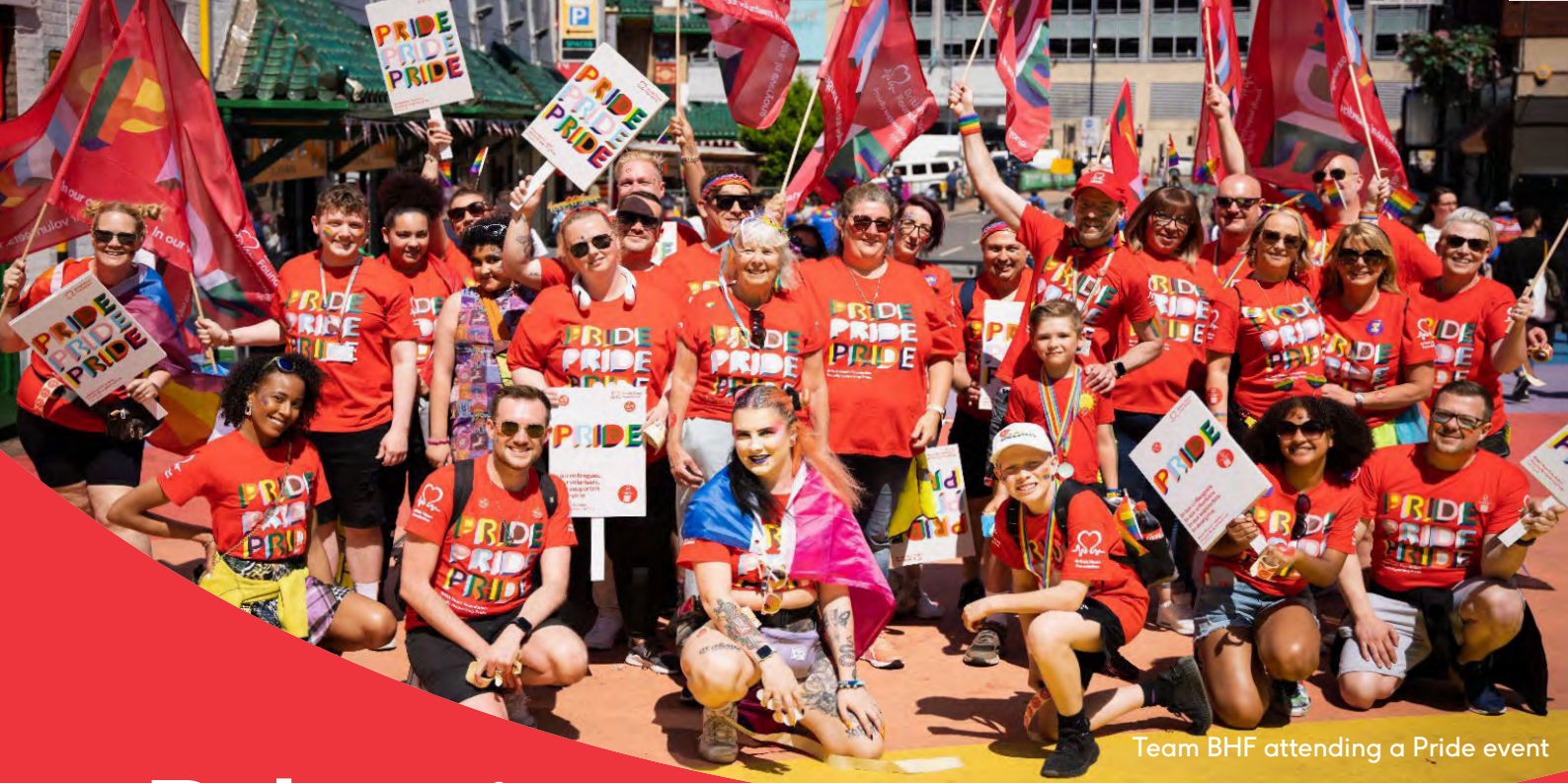
Team BHF attending a Pride event