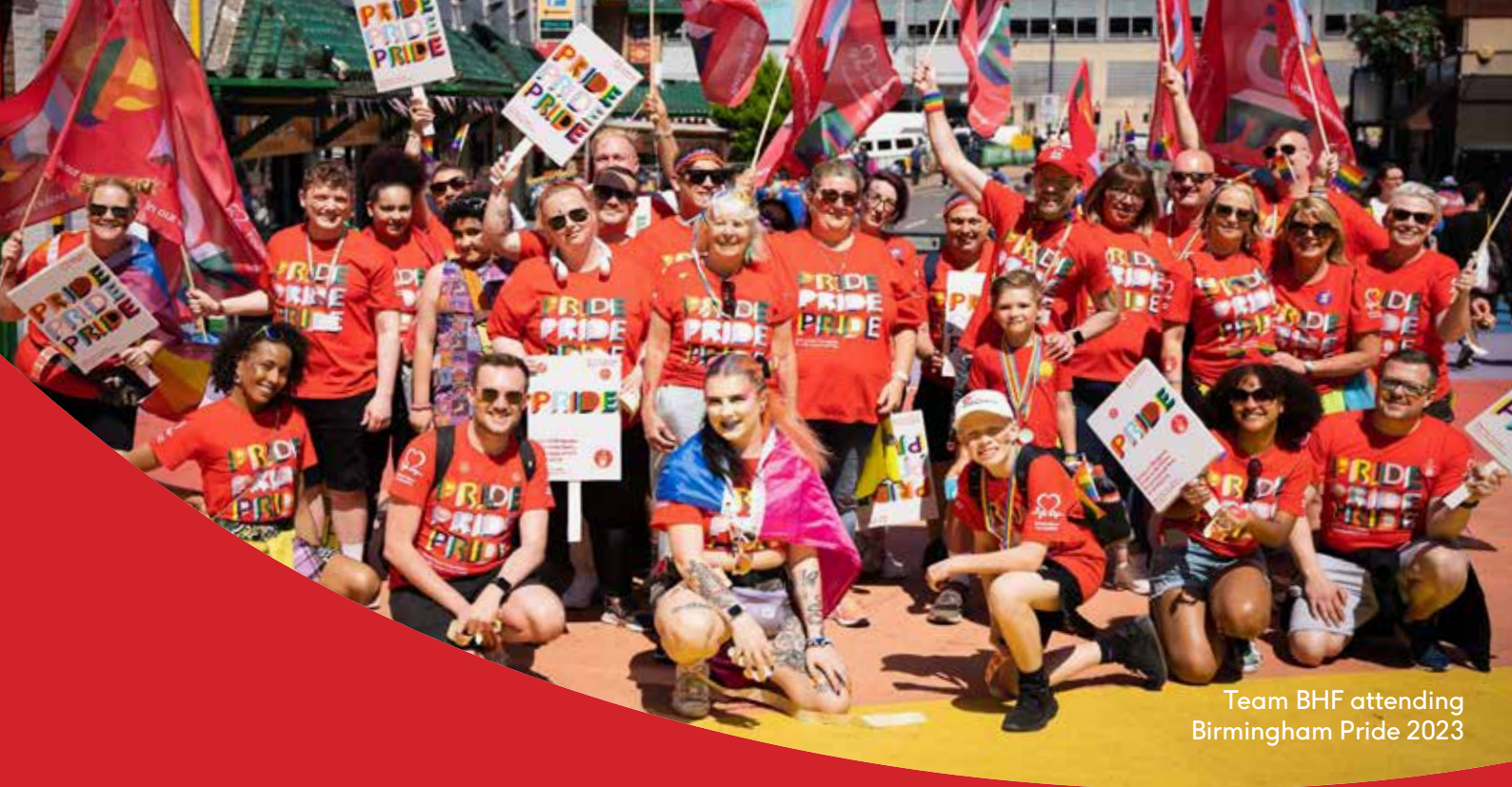
Team BHF attending Birmingham Pride 2023