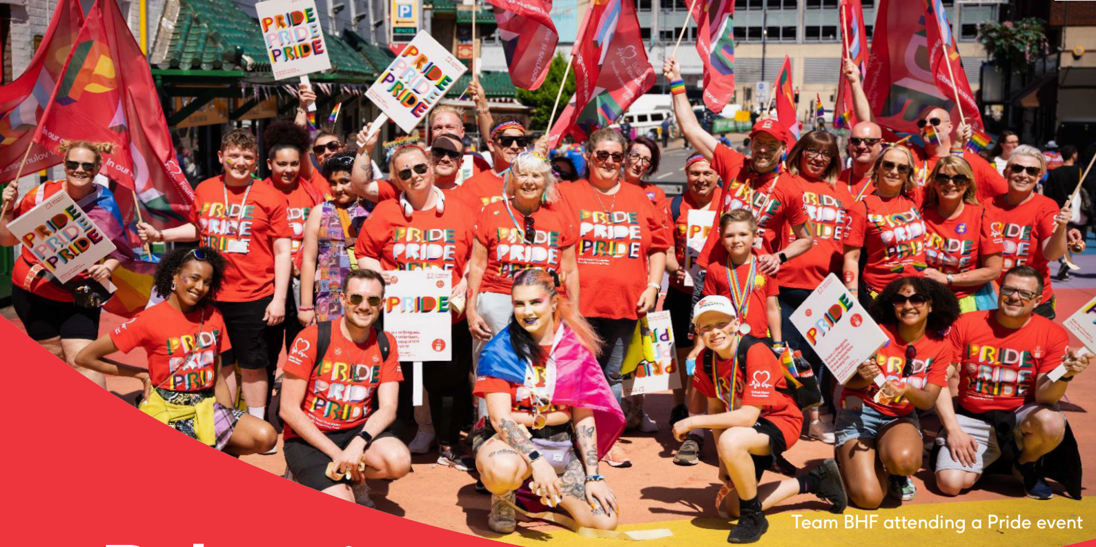
Team BHF attending a Pride event