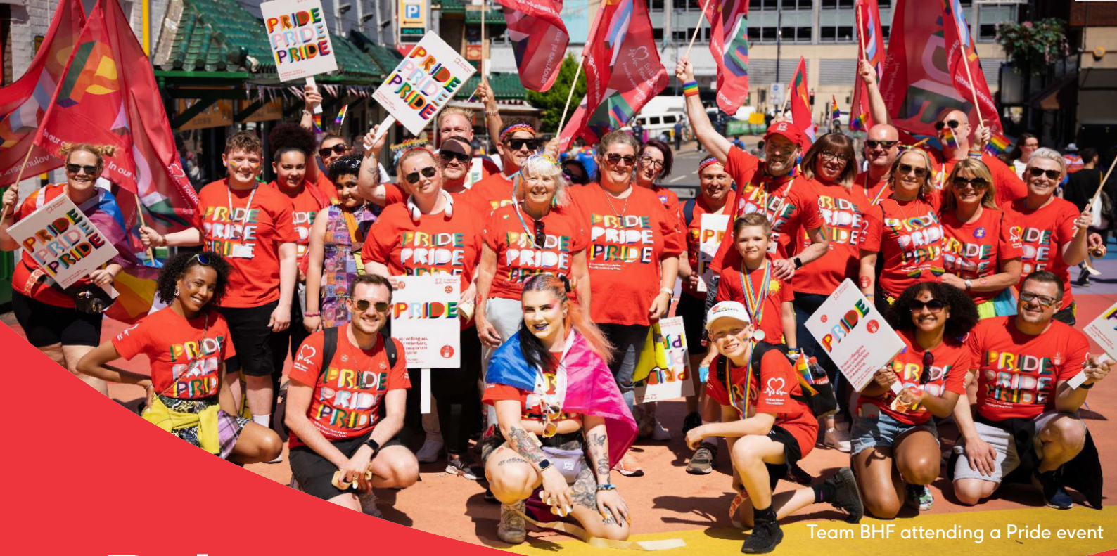
Team BHF attending a Pride event